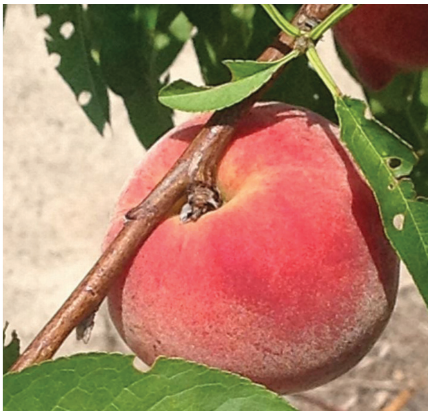
Figure 9. ‘UFGlo’

cultivar ‘Flordaking’ does well, and it complements ‘UFSharp’ peaches in north central Florida. It produces consistent crops with good yields in north Florida (Figure 9).