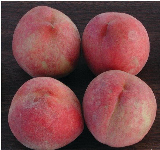
Figure 33. 'Flordaglo'

'Flordaglo' is a melting-flesh cultivar released by UF in 1988. The fruit develops 50–60% red blush with stripes, over a white ground color. 'Flordaglo' fruit are early ripening, semi-clingstone, and are bacterial spot resistant. Fruit ripens in early May, approximately 78 days after full bloom. 'Flordaglo' fruit is ideal for backyard or u-pick operations due to the melting flesh texture and its tendency to show bruises and abrasions easily (Figure 33).