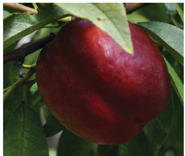
Figure 28. 'Sunraycer'

'Sunraycer' is a non-patented melting-flesh nectarine cultivar released in 1993. Trees are vigorous and semi-spreading, responding well to open-center pruning systems. 'Sunraycer' produces large, semi-clingstone fruit with good firmness resistance to bacterial spot. 'Sunraycer' fruit develop 80–100% brilliant red blush over a bright yellow ground color and are oval with no sharp tips or suture bulges. 'Sunraycer' has an 85-day FDP and ripens in early May in Gainesville, Florida (Figure 28).