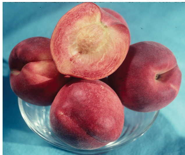
Figure 11. ‘Gulfcrest’

‘Gulfcrest’ is a 2004 release from the UF, UGA and the USDA-ARS joint breeding program. It has an FDP of 62–75 days and has non-melting flesh with a clingstone pit. Ripe ‘Gulfcrest’ fruit have 90–95% red color over a deep yellow to orange ground color and ripen in early to mid-May in southern Georgia. ‘Gulfcrest’ fruit can be variable in size on the tree and can produce “twiggy” branch growth. ‘Gulfcrest’ is adapted to extreme northern Florida and southern Georgia (Figure 11).