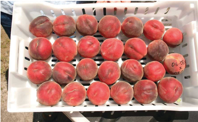
Figure 18. 'UFGem'

'UFGem' was released in 2013 and is a good candidate for the northern part of central Florida. It is a commercial cultivar with near 100% blush, average fruit size of 2.5-inch diameter, and symmetrical fruit shape. It is a clingstone peach with non-melting, yellow flesh, and firm texture. The average FDP is 83 days and sets fruit well when minimum nighttime temperatures are above 57°F (14°C) (Figure 18).