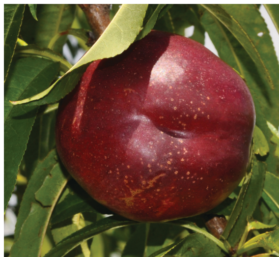
Figure 12. ‘Sunbest’

‘Sunbest’, released in 2001, is a patented nectarine cultivar with yellow, melting flesh, and a semi-freestone pit. It develops 90–100% bright red blush over a yellow ground color, and has a FDP of 85–90 days. ‘Sunbest’ ripens in early May (Gainesville, FL), about 3 days before the standard ‘Sunraycer’ nectarine cultivar. It is superior to and a good replacement for ‘Sunraycer’ nectarine (Figure 12).