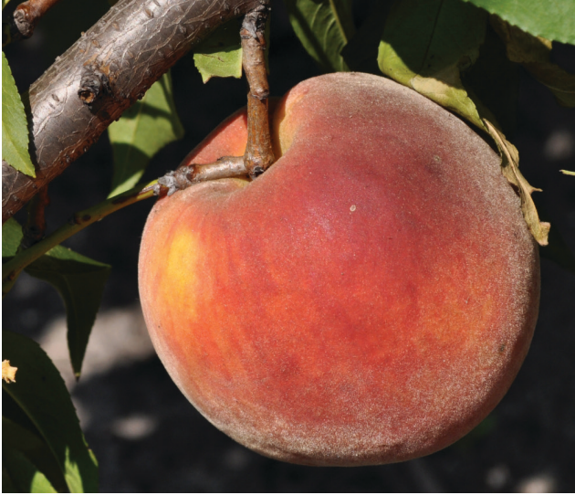
Figure 17. 'TropicBeauty'

'TropicBeauty' ripens between 'UFSun' and 'UFOne' and has an FDP of 89 days (Figure 17).