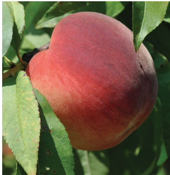
Figure 35. 'TropicSnow'

'TropicSnow' was jointly released by UF and Texas A&M in 1989. Its fruit has white, melting-flesh, semi-freestone pits. 'TropicSnow' fruit develop 40–50% red blush over a creamy white background and have very low acid combined with excellent sweetness. 'TropicSnow' has an FDP of 90–97 days (Figure 35).