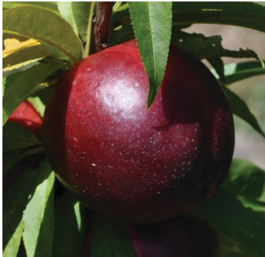
Figure 29. ‘Sunbest’

‘Sunbest’ is a patented melting-flesh nectarine cultivar released in 2001. ‘Sunbest’ trees are semi-upright and vigorous, responding well to open-center pruning systems. ‘Sunbest’ fruit develop 90–100% bright red blush over a yellow ground color, are semi-freestone, and resist bacterial spot well. ‘Sunbest’ is intended as a replacement for ‘Sunraycer’ nectarine because of its larger and more attractive fruit. ‘Sunbest’ has an FDP of 85–90 days, and fruit ripens approximately 3 days before ‘Sunraycer’ nectarine and ‘Flordaglo’ peach in Gainesville, FL (Figure 29).