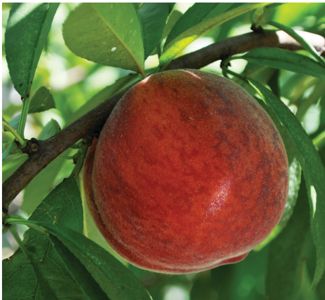
Figure 6. 'Gulfking'

'Gulfking' is a non-melting-flesh cultivar that was released and patented by the joint UF, UGA, and USDA-ARS breeding program in 2004 (Krewer et al. 2005). The fruit has exceptional color, with 80–90% red skin with stripes over a deep yellow ground color. The fruit is very firm with yellow flesh and is clingstone. The FDP is 77 days, and the fruit develops good size, shape, and color in north Florida (Figure 6).