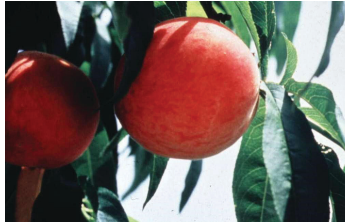
Figure 23. 'Flordadawn'

'Flordadawn' is a melting-flesh non-patented peach cultivar released in 1989. 'Flordadawn' trees are vigorous and produce large numbers of flowers with moderately high fruit set. The bloom period of 'Flordadawn' is extended, which can help with fruit set during early spring frosts. The FDP of 'Flordadawn' is 60 days, which is the shortest of any named peach variety. Fruit of 'Flordadawn' develop 80% red blush and have yellow flesh with a semi-clingstone pit. However, light crop loads have resulted in as much as 50% split pit incidence. 'Flordadawn' can often be found in large stores and nurseries for backyard plantings (Figure 23).