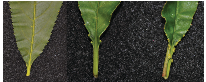
Figure 3. Eglandular (a), globose (b) and reniform (c) leaf glands on peach leaves.