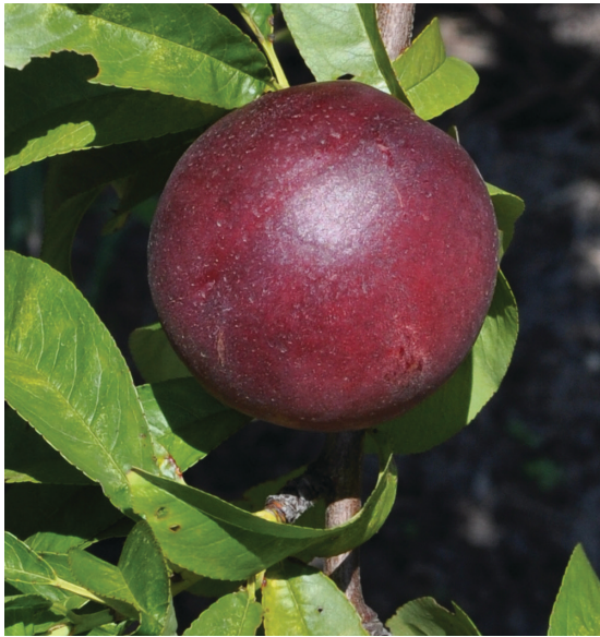
Figure 13. ‘UFRoyal’

‘UFRoyal’ is a yellow flesh, non-melting nectarine, with an FDP of 85 days. ‘UFRoyal’ fruit is large, with 100% red skin, and a semi-clingstone pit. Fruit are symmetrically oval and ripen approximately 1 week before ‘UFQueen’ (below) in early May (Gainesville, FL). ‘UFRoyal’ fruit have excellent firmness and flavor, with excellent shipping potential (Figure 13).