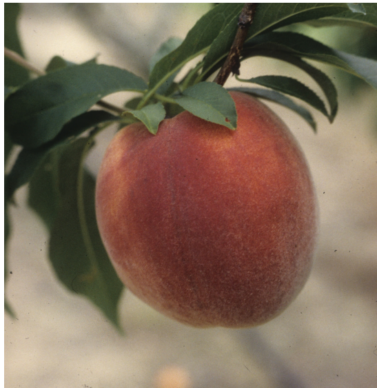
Figure 25. 'Flordacrest'