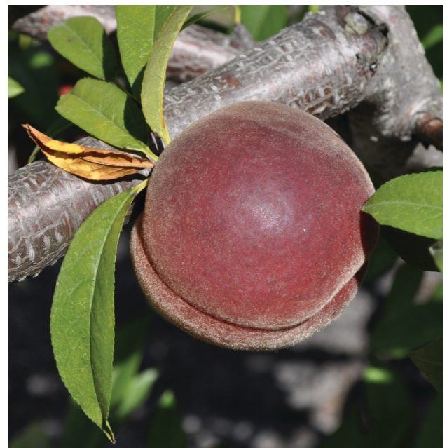
Figure 4. ‘Flordabest’

‘Flordabest’ was released and patented in 2009 and has a FDP of 82 days from fruit set to harvest. The fruit develop 90–100% blush, making them very attractive. The fruit is large, and have melting, but uniformly firm yellow flesh, and semi-clingstone pits. The fruit ripens about 7–10 days earlier than the standard peach cultivar ‘TropicBeauty’ in Gainesville, Florida. It is recommended for trial in Gainesville and south to Interstate 4 (Figure 4).