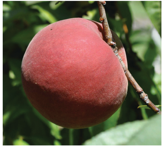
Figure 19. 'UFBeauty'

'UFBeauty' is a peach cultivar released in 2002 with fruit that has non-melting-flesh, clingstone pits, and very symmetrical shape. The flesh of 'UFBeauty' fruit is yellow and very firm, and the skin color is near 100% red, with darker red stripes. 'UFBeauty' ripens 3 to 4 days after 'UFGold' in Gainesville, Florida, with an FDP of 82 days. Cropping of 'UFBeauty' has been unreliable in south Florida when night temperatures during the bloom period are higher than 57°F (14°C) (Figure 19).