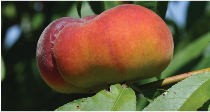
Figure 5. 'UFO'

FDP of 95 days. The skin develops 50–70% blush. This cultivar is particularly susceptible to ethylene that is released during dormant pruning, which can result in significant flower bud abortion. Thus, pruning is only recommended during the summer period (Figure 5).