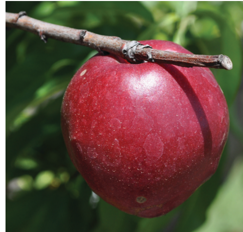
Figure 31. ‘Suncoast’

‘Suncoast’ is a non-patented melting-flesh nectarine cultivar released in 1995. ‘Suncoast’ trees are vigorous and semi-spreading. Fruit of ‘Suncoast’ have yellow flesh, develop 80–90% red blush over a yellow ground color, and are semi-clingstone. ‘Suncoast’ fruit are slightly oblong with no sharp tips or bulges and tend to be tart. ‘Suncoast’ leaves and fruit are resistant to bacterial spot. The FDP of ‘Suncoast’ fruit is 77 days, and fruit ripens in late April to early May in Gainesville, FL (Figure 31).