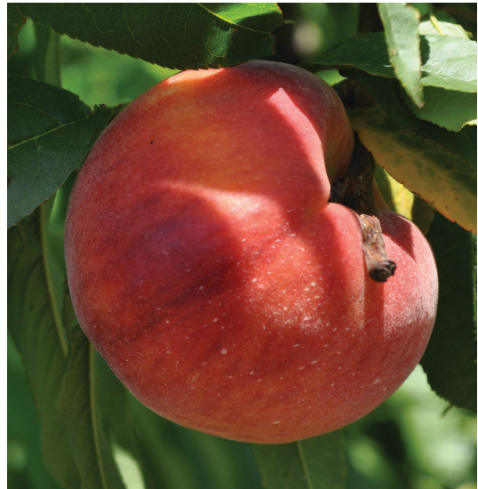
Figure 15. ‘UFSun’

‘UFSun’ fruit ripens with that of the standard peach cultivar ‘Flordaprince’ at Immokalee and Gainesville, Florida with an FDP of 80 days (Figure 15).