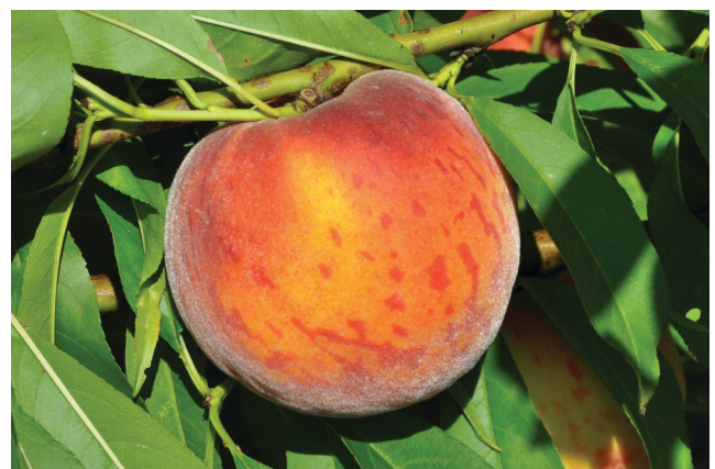
Figure 32. ‘Flordaprince’

‘Flordaprince’ was released by UF in 1982 and its fruit has melting flesh. It has been a standard low-chill peach cultivar worldwide and is one of the earliest ripening. The fruit develops 80% red blush with dark red stripes over a yellow ground color. ‘Flordaprince’ fruit are large, uniformly firm, and yellow, with semi-clingstone pits. The fruit ripens about 7–10 days earlier than ‘TropicBeauty’ in Gainesville, Florida, with an FDP of 78 days (Figure 32).