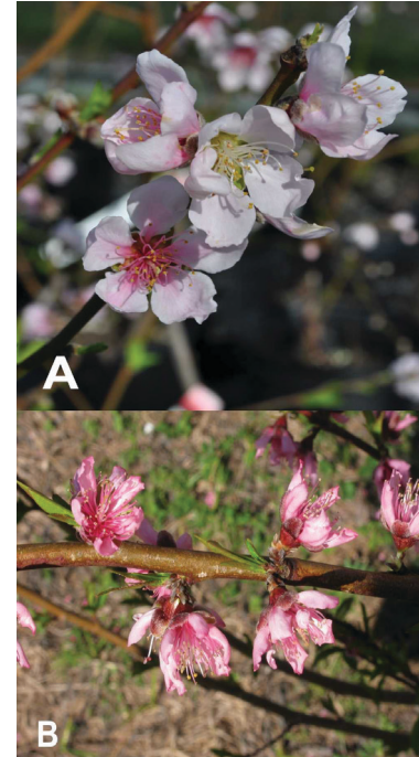
Figure 2. Showy (a) and non-showy (b) peach flowers.

vigorous (e.g., ‘Sunbest’) in canopy growth. Flowers on certain peach cultivars can be showy , with large, pink petals; flowers on other cultivars are non-showy , with smaller, redder petals (Figure 2). Leaf glands at the base of the leaf near the petiole can also be used in the identification process. Leaf glands may be absent ( eglandular ), or they may be globose (round) or reniform (kidney-shaped) (Figure 3).