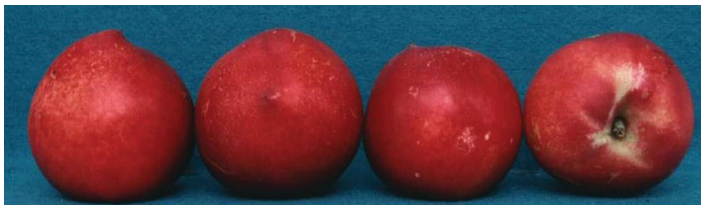
Figure 14. ‘UFQueen’

‘UFQueen’ is a regular bearer of early, large fruit in north central Florida, with an FDP of 95 days. ‘UFQueen’ trees are semi-upright and are easily pruned to an open vase system. The fruit has non-melting flesh with clingstone pits and yellow flesh color. The fruit is slightly oval with a slight tip and develops 80–100% red skin over a yellow background. ‘UFQueen’ fruit ripens about 1 week after the standard ‘Sunraycer’ nectarine cultivar in mid-May in Gainesville, Florida (Figure 14).