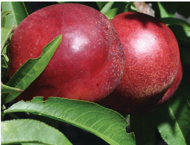
Figure 30. ‘Sunmist’

‘Sunmist’ is a patented melting-flesh nectarine cultivar released in 1994. ‘Sunmist’ trees are highly vigorous and have a spreading growth habit. Fruit of ‘Sunmist’ have white flesh, are semi-freestone, and are large for an early ripening cultivar. Fruit develop nearly 100% red blush and are uniformly symmetrical. ‘Sunmist’ trees and fruit are highly resistant to bacterial spot. The FDP is 85 days, and the fruit ripens in early May in Gainesville, FL (Figure 30).