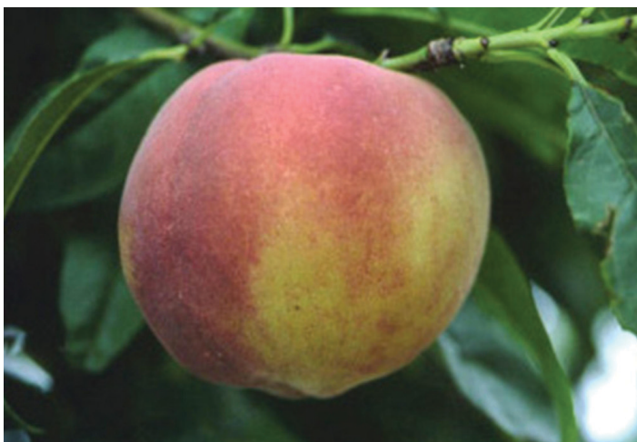
Figure 34. 'UFGold'

'UFGold' is a non-melting, yellow-flesh clingstone peach released by UF in 1996. 'UFGold' trees bear heavy annual crops of large fruit. Fruit are symmetrical in shape and develop 70–90% blush over an orange-yellow ground color. 'UFGold' fruit ripen approximately 80 days after bloom, in early May (Gainesville, FL) (Figure 34).