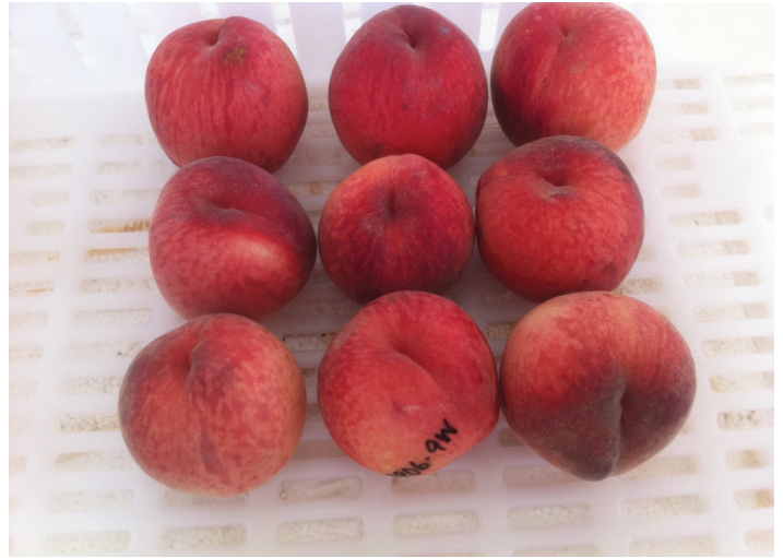
Figure 7. 'Gulfsnow'

a 50–60% blush over a cream background. The fruit is clingstone, with medium-sized, red pits and have an FDP of 110 days (Figure 7).