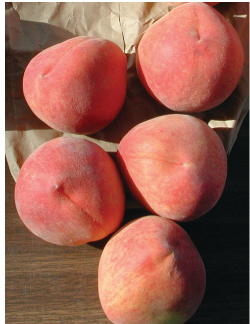
Figure 27. 'Flordaking'

fruit is high incidence of split pits when crop loads are low (Figure 27).