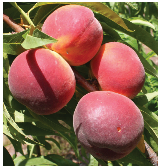
Figure 16. ‘UFBest’

‘UFBest’ released by the UF breeding program in 2012, this non-melting-flesh cultivar produces heavy annual crops of large fruit. ‘UFBest’ fruit develop 95–100% red skin over a yellow ground color, and the flesh is yellow with clingstone pits. ‘UFBest’ ripens 1 week earlier than ‘UFSun’ (mid-April) in Gainesville, Florida, with an FDP of 85 days (Figure 16).