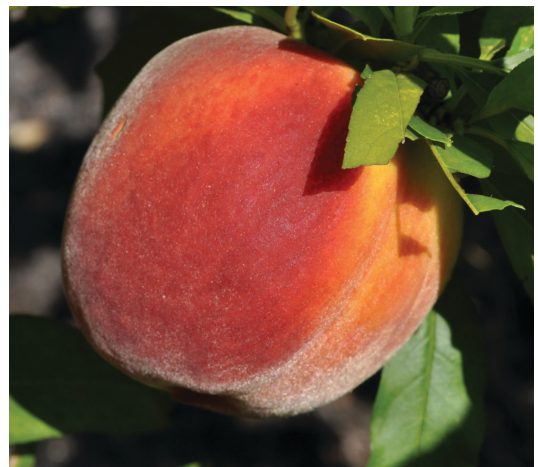
Figure 20. 'UFOne'

'UFOne' is a non-melting-flesh cultivar released by UF in 2008. 'UFOne' fruit is medium-large, and the trees regularly bear large crops of marketable fruit. 'UFOne' fruit is very firm with yellow flesh and semi-clingstone pits and develop 40% red blush over a yellow ground color. 'UFOne' fruit has a fairly long FDP of 95 days and ripen with 'UFBeauty' (early May) in Gainesville, Florida (Figure 20).