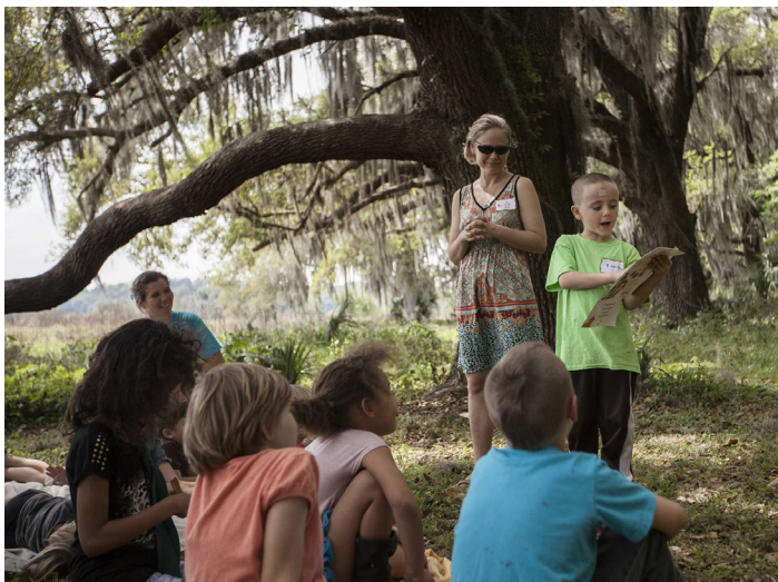
Figure 3. An outdoor education program with Alachua Conservation Trust's Tuscawilla Learning Center on their Tuscawilla Preserve.