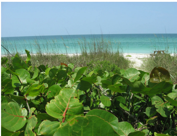
Figure 1. Coastal dunes and beach protected by the Conservation Foundation of the Gulf Coast in Florida.