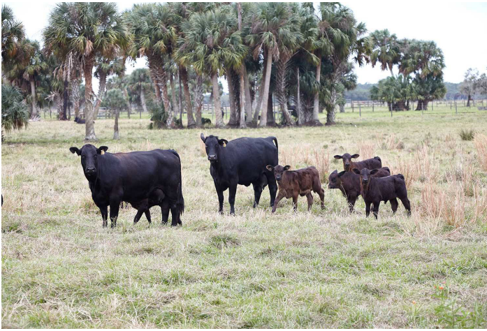
Figure 5. Ranchland protected by the Conservation Trust for Florida in partnership with Pelaez and Sons Ranch.