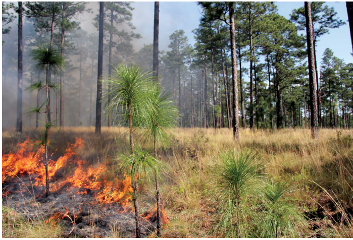
Figure 2. Longleaf pine forest protected by the Tall Timbers Conservancy in Florida.