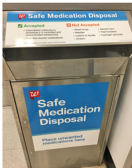
Figure 3. Anonymous medication disposal drop-off box offered by a pharmacy in Gainesville, FL.

Trash and recycling services offered by city and county governments may also provide this service. Additionally, many sheriff's offices and police departments throughout the state of Florida offer anonymous medication drop-off locations. Finally, pharmacies may provide drop-off locations within their stores (Figure 3). In order to identify the best location or event to bring your unwanted medications for disposal, you may contact your local trash and recycling service, your sheriff's office or police department, or your nearby pharmacy. In lieu of contacting these organizations, a list of year-round controlled substance public disposal locations can be found at https://apps.dea diversion.usdoj.gov/pubdispsearch/spring/main?execution=e1s1 .