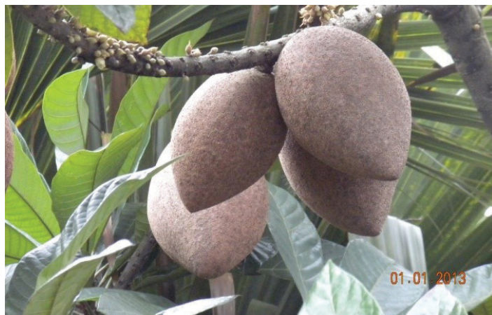
Figure 2. ‘Magaña’ cultivar.