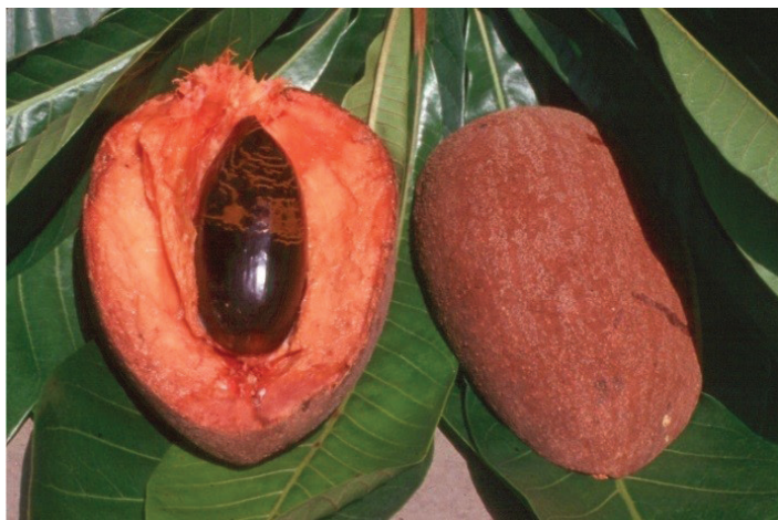
Figure 3. 'Pantin' cultivar.

There is little information on the production costs and returns of minor tropical fruit crops, so our objective is to provide an estimate of the costs and returns associated with an established mamey sapote orchard in south Florida. Our information was obtained from field interviews with industry experts and with growers cultivating the fruit in small acreages (1–3 acres) in south Florida. The information presented reflects a wide variety of production practices, and it is intended only as a guide to estimate the financial requirements of maintaining a mamey sapote grove. Readers interested in specific information about the cultural practices of mamey sapote may wish to peruse FC-30, Mamey Sapote Growing in the Florida Home Landscape by Balderi et al. (2008) ( http://edis.ifas.ufl.edu/mg331 ).