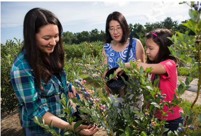
Figure 1. A family visits a blueberry u-pick operation, an example of agritourism.

An agritourism learning experience can have many similarities to an Extension program. Based on principles for program planning for Extension (Diaz, Gusto, & Diehl, 2017), we suggest five basic steps to consider when designing an experience: 1) understand the situation you want to change, 2) determine your audience, 3) determine desired outcomes, 4) design and enact learning activities, and 5)