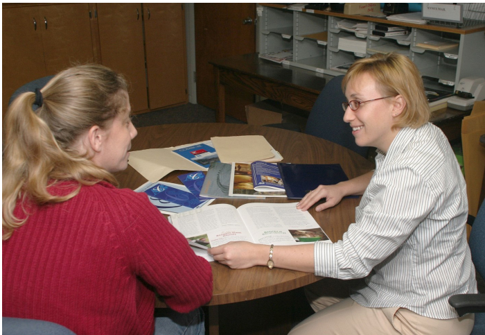
Figure 4. One way to evaluate your activities or materials is to interview people and ask them to comment on the experience.

Once you implement your learning experiences, evaluation can help you decide how well they are working for both you and your visitors. Evaluation for you and your staff can be as easy as counting how many visitors participate and informally asking how the staff feels about the effort that is involved. Evaluating visitors can be as informal as judging participant attitudes by their expressions during the experiences, listening to visitor comments during and after the activities, or inviting visitors to fill out comment cards. Evaluation can also be much more in-depth, involving paper or online surveys and more extensive interviews. For more information on evaluation, consult your Extension agents and the EDIS publications in the Resources section. The most important thing you can do with evaluation results of any type is to act on them by refining your experiences.