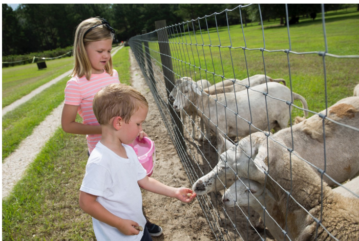
Figure 2. Perhaps you have observed people improperly feeding your animals, and you want to develop an experience to encourage correct feeding habits.

First, you must have an idea about what your visitors currently want to know or behaviors you might want visitors to change. You can understand the current situation in a variety of ways. You could work with your Extension personnel to find existing resources on the topic or behavior, as they or their research colleagues may have recent information on Florida residents in particular. You could read trade publications, which may alert you to policies under review that you may want your visitors to support, or which report recent consumer survey results. Finally, you can get information directly from your desired audience through your own surveys, observations, or interviews.