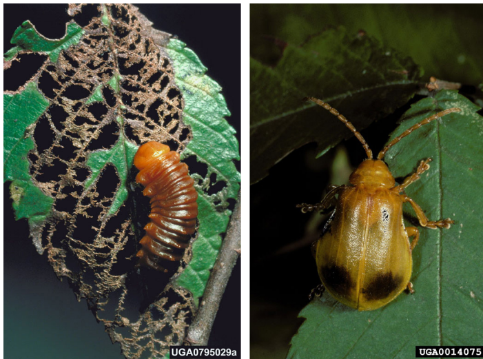
Figure 7. Larger elm leaf beetle larvae (left) and adult (right).

Management Recommendations: There are some natural predators, but these are usually not sufficient to control beetles in the nursery.