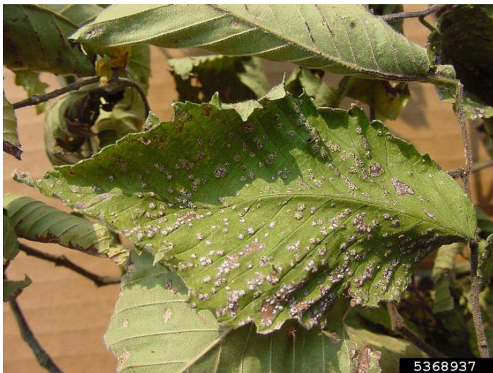
Figure 2. Leaves with cushion-like fungus caused by black elm spot.

Management Recommendations: Remove leaf debris and dead shoots from the trees during the winter. Avoid tight spacing and overhead irrigation. Preventative fungicide may be applied during budbreak in the spring and at regular intervals until leaves are fully developed (Elliott and Harmon 2014).