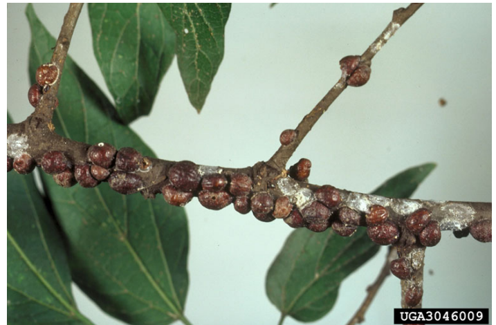
Figure 8. Lecanium scale infestation on sugarberry.

Management Recommendations: Scale insects can be biologically controlled, as they are attacked by a variety of lady beetles, predatory mites, and small, parasitic wasps. The outer covering protects adult scales, so smothering oil sprays or systemic chemicals are required to control them. Contact sprays should be targeted to the crawler stage.