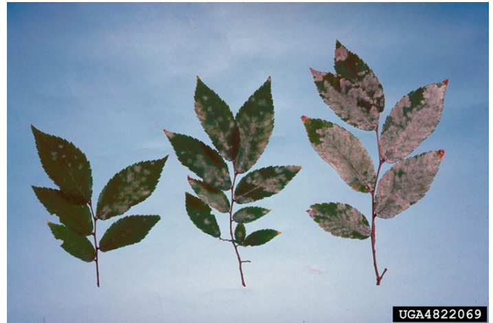
Figure 3. Various stages of powdery mildew infection on winged elm leaves.

Management Recommendations: Prune young trees for good air circulation, irrigate in the morning, prune out affected plant parts, and apply protective fungicides like copper sulfate at first sign of infection (Zhang, Palmateer and Pernezny 2017).