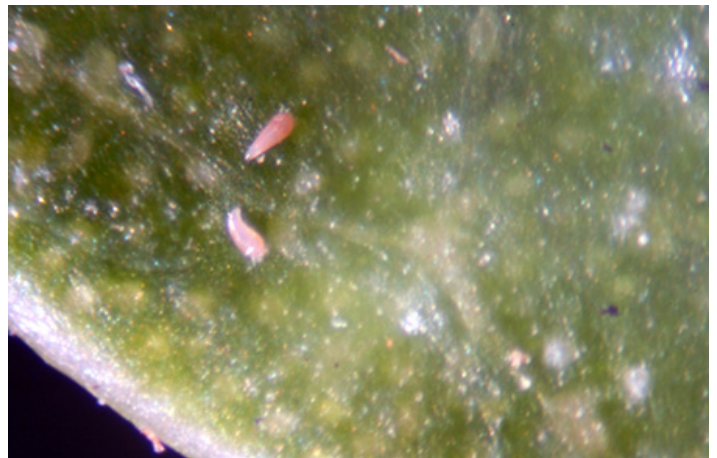
Figure 6. Eriophyid mites.

Management Recommendations: Prune out and destroy infested twigs to control and remove the adults. If the infestation is severe, a dormant oil mixture or a miticide should be used.