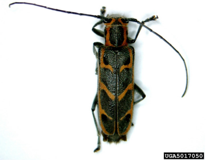
Figure 5. Left: Damage caused by elm borers. Right: Adult elm borer.