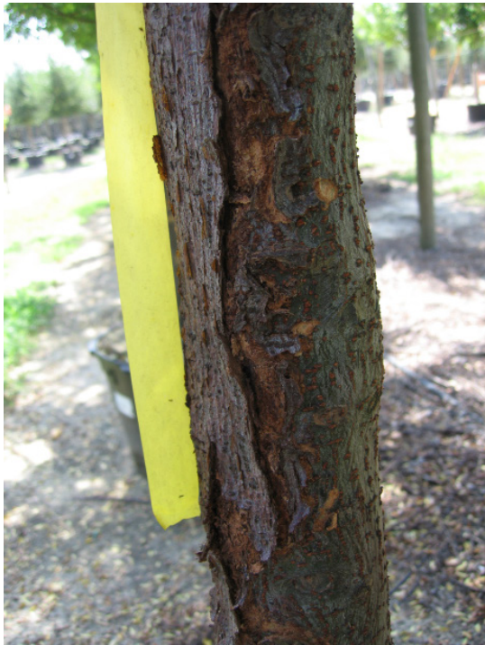
Figure 4. Young Chinese elm bark displaying canker symptoms.

of beetles. The elm borer, Saperda tridentate (Oliver), is a beetle that feeds under the bark and girdles the trunk. The dogwood twig borer, Oberea tripunctata , is a moth that infests the twigs of elm. The larva tunnels through the terminal twigs and cut small holes to the outside from which they expel sawdust and feces. Infested twigs are girdled and killed by the female when she lays eggs. Infested twigs wilt and hang on the tree or drop to the ground (Gyeltshen and Hodges 2016).