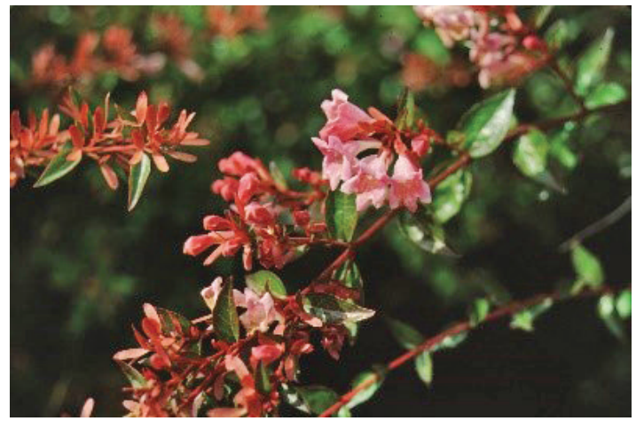
Figure 4. Flower— Abelia x grandiflora : glossy abelia.