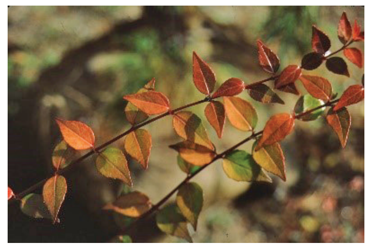
Figure 3. Leaf— Abelia x grandiflora : glossy abelia.