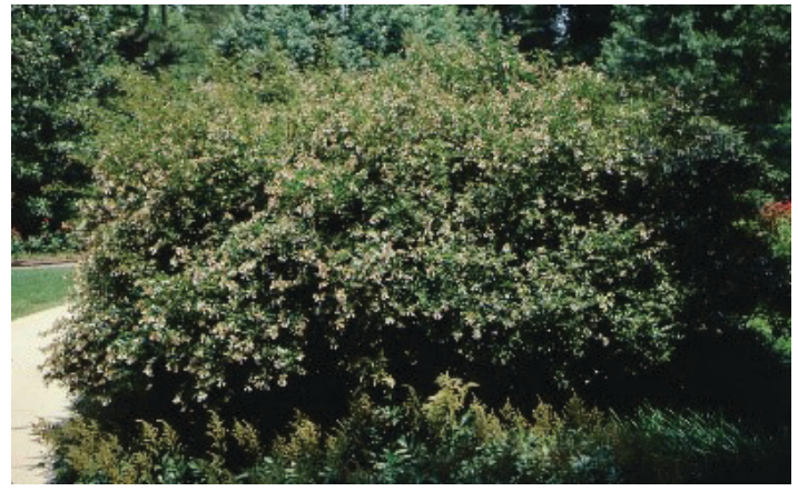
Figure 1. Full Form, Natural— Abelia x grandiflora : glossy abelia.

Glossy abelia is a fine-textured, semi-evergreen, sprawling shrub with 1½ inch-long, red-tinged leaves arranged along thin, arching, multiple stems. It is a hybrid between A . chinensis and A . uniflora . It stands out from other plants because the leaves retain the reddish foliage all summer long, whereas many plants with reddish leaves lose this coloration later in the summer. Considered to be evergreen in its southern range, glossy abelia will lose 50% of its leaves in colder climates, and the remaining leaves will take on a more pronounced red color. Reaching a height of 6 to 10 feet with a spread of 6 feet, the gently rounded form of glossy abelia is clothed from spring through fall with terminal clusters of delicate pink and white, small, tubular flowers. Multiple stems arise from the ground in a vase shape, spreading apart as they ascend into the foliage.