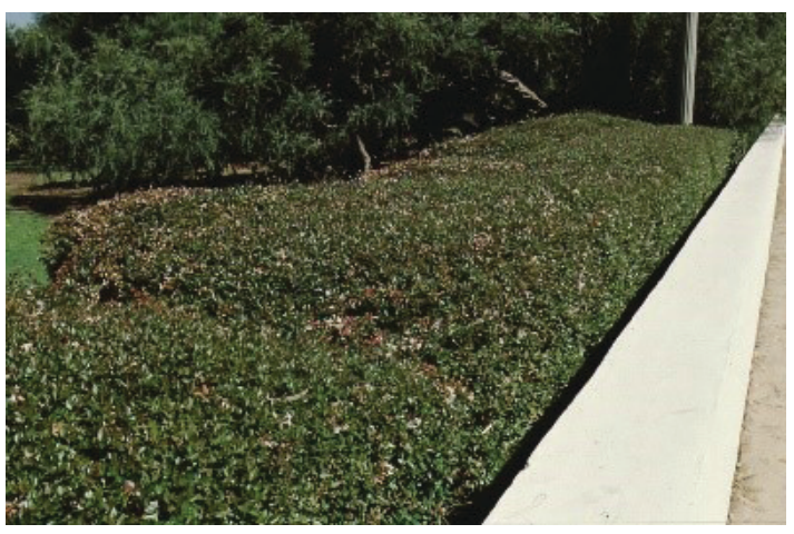
Figure 2. Full Form, Manicured— Abelia x grandiflora : glossy abelia.