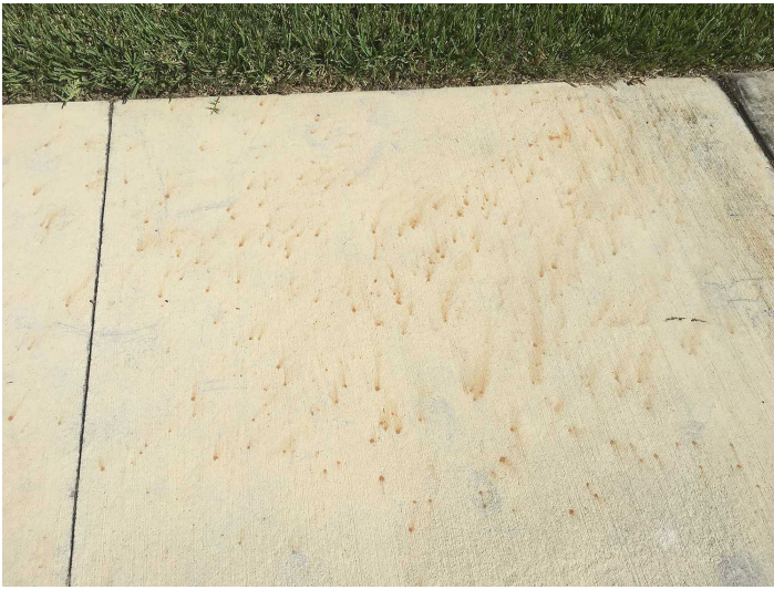
Figure 3. Fe sulfate fertilizer particles will rapidly dissolve and stain wet surfaces like this sidewalk in Gainesville.