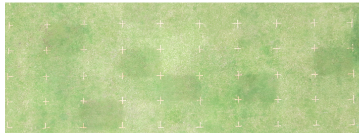
Figure 1. Bermudagrass showing response to foliar iron (each dark green rectangle) compared to granular Fe or no Fe (all remaining rectangles).

especially to bahiagrass, centipedegrass, and St. Augustinegrass. This can be frustrating because the N application should have resulted in greener turfgrass, but, in fact, the lawn may appear chlorotic in places. The most likely explanation is that during the winter months, the rate of turfgrass shoot and root growth declines. In north Florida, growth may cease altogether, whereas in south Florida, growth may slow down. Nitrogen applied during the spring encourages turfgrass growth and, in turn, increases the demand for Fe. This demand for Fe cannot be met because turfgrass root growth is still limited in the spring and, thus, the ability to take up Fe is low, resulting in chlorotic leaf blades. Cool, wet soils tend to exacerbate this chlorosis. As soil temperatures increase, the quantity of turfgrass roots increases, resulting in greater uptake of Fe and a decrease in Fe deficiency symptoms. Springtime occurrences of Fe deficiency normally dissipate within a few weeks. Otherwise, turfgrass Fe chlorosis can be minimized by applying foliar Fe (liquid Fe applied to the leaves) at a rate between 1–5 lbs of Fe per acre (Figure 1).