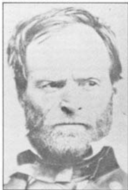
William T. Sherman, 1865.

I never had seen the old man in my life, nor any of his family that I remember. He had seen me somewhere, and had seen my father and told him that he wanted me to come down there and work in