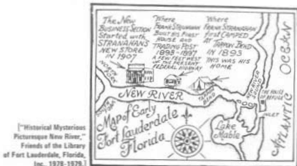
["Historical Mysterious Picturesque New River," Friends of the Library of Fort Lauderdale, Florida, Inc., 1978-1979.]

I got down right close to Pompano and gave out, had a sunstroke; that is not exactly, I saw I was going to fall if I didn't get in the woods