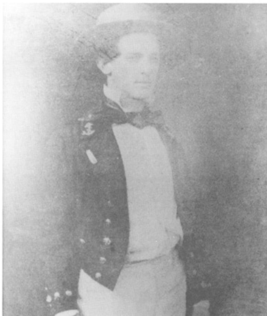
This 1842 portrait of a midshipman — one of the earliest known naval photographs — shows the uniform worn during the Second Seminole War.