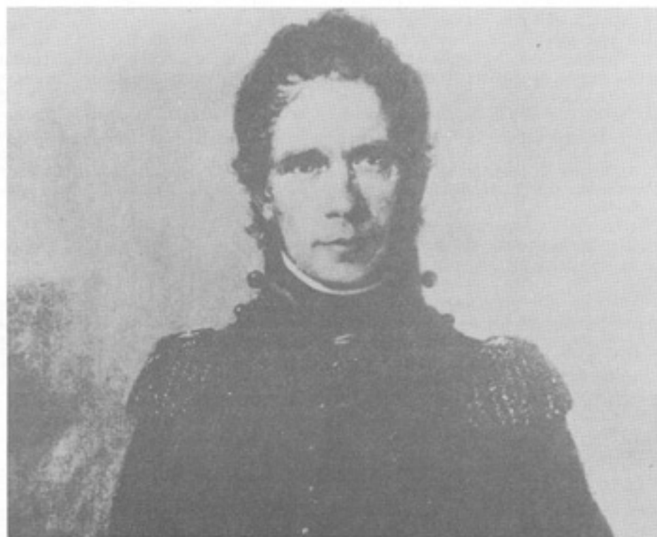
Major General Thomas Sidney Jesup, commander of United States Army forces in Florida, 1836-1838.