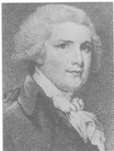
Commodore Alexander J. Dallas (left, in an early portrait,), and U.S. Navy Secretary Mahlon Dickerson (right,) were instrumental in involving the navy in the Second Seminole War.