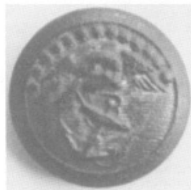
U.S. Marine Corps button from the Second Seminole War, recovered from the Caloosahatchee River area of Southwest Florida.

Upon the conclusion of the 1837-1838 winter campaign, the demand for coastal protection lessened, causing Commodore Dallas to release from the West Indies Squadron the revenue cutters Madison and Jackson . In the meantime, General Jesup considered launching a campaign from his headquarters at Tampa, but the frustrations inherent in trying to corner the scattered Seminoles and escalating criticism from both Congress and the general public led the major general to resign his Florida command on May 15, 1838. Before returning to his previous duties as Quartermaster General for the United States Army, Jesup transferred the Florida command to Brevet Brigadier General Zachary Taylor. By the time Taylor assumed command, government cutbacks forced a change of strategy in the Florida theater, and marked an end to major military campaigning in south Florida. Ironically, this development would increase the demand for naval participation in that region.