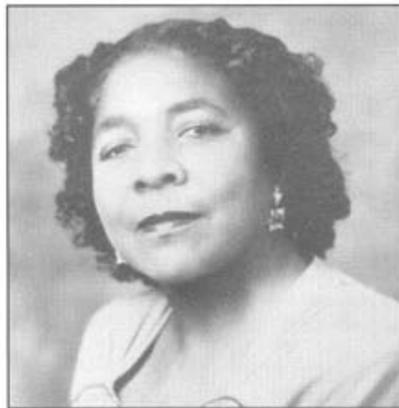
Blanche General Ely.