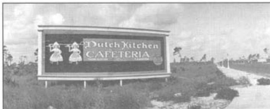
This sign at the entrance to Croissant Park in the 1920s was one of many in and around Fort Lauderdale painted by the Lewis Sign Company.