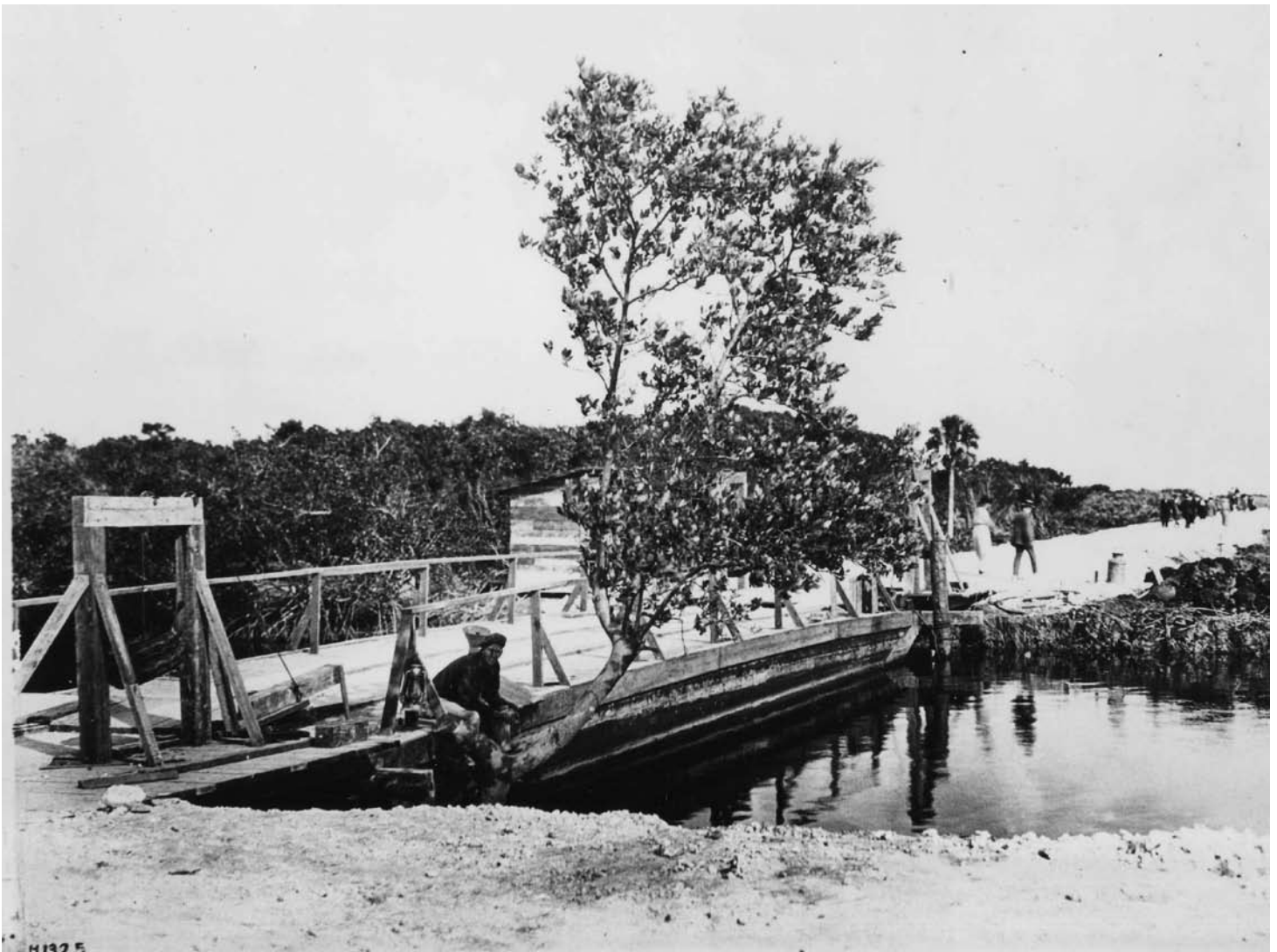
Barge bridge over the Florida East Coast Canal ca 1920s at Johnson Street.

This book is very informative and fills a large gap in Florida's history. Parts dealing with the many individual investors and their money might be difficult reading for some. For others they will prove fascinating. The book is highly recommended to anyone interested in how the Intracoastal Waterway came about.