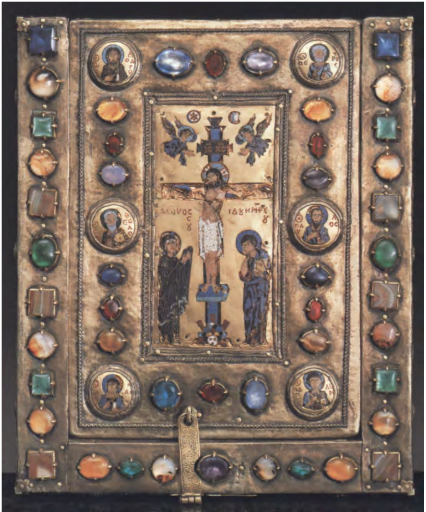
Figure 9. Reliquary of the True Cross, late 10th - early 11th century. Silver-gilt on wood, gold cloisonné enamel, stones, 270 x 220 mm. Treasury of San Marco, Venice.