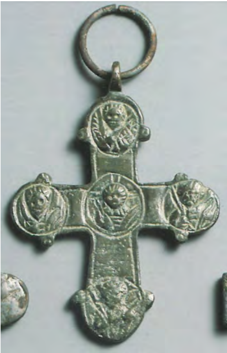
Figure 6. Enkolpion, front, 11th-12th century. Bronze. Archaeological Museum, Komotini, Greece.