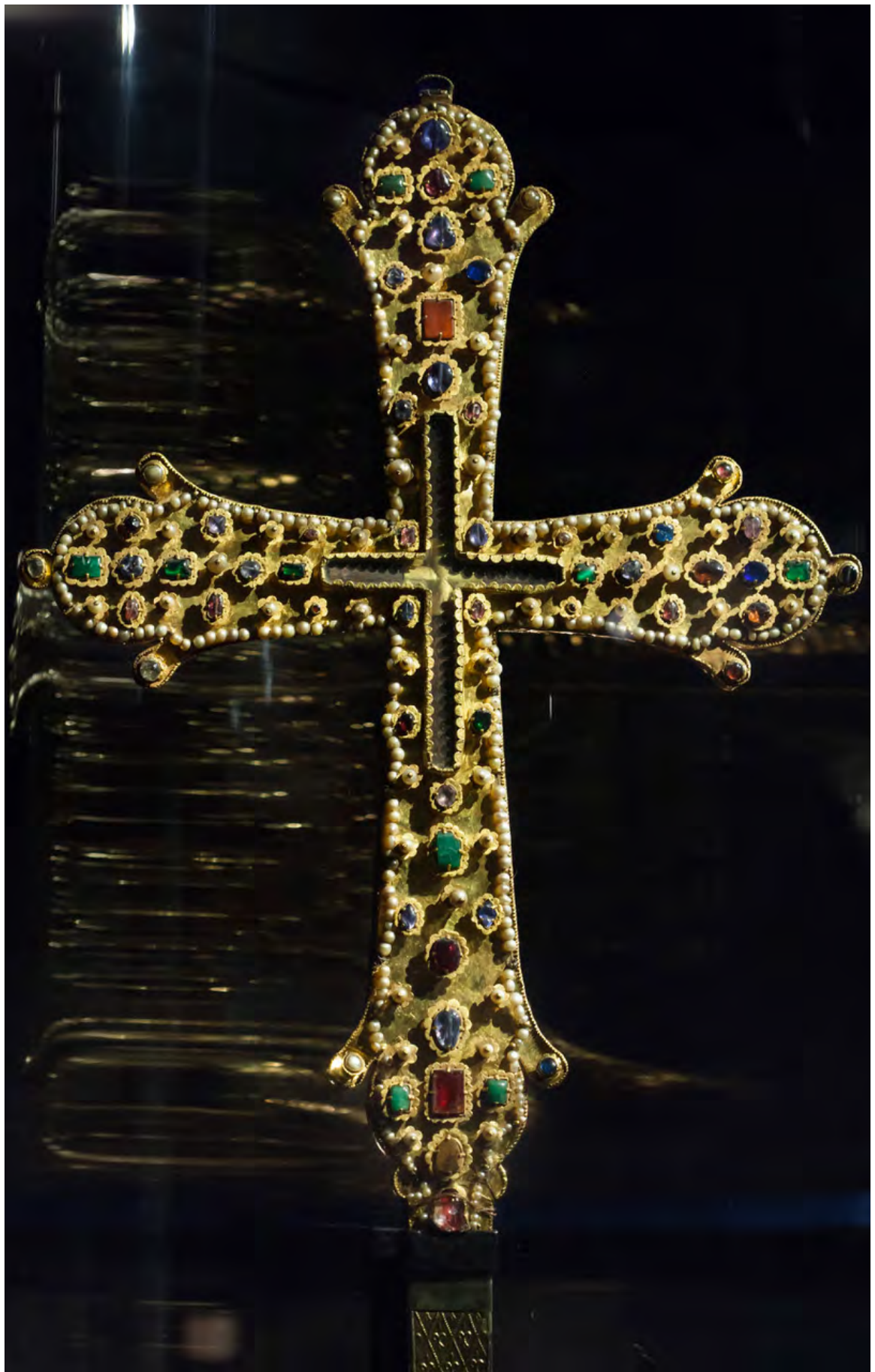
Figure 1. Croce degli Zaccaria , front. Silver-gilt, gems, wood, 54 x 40 cm. Treasury of San Lorenzo, Genoa.