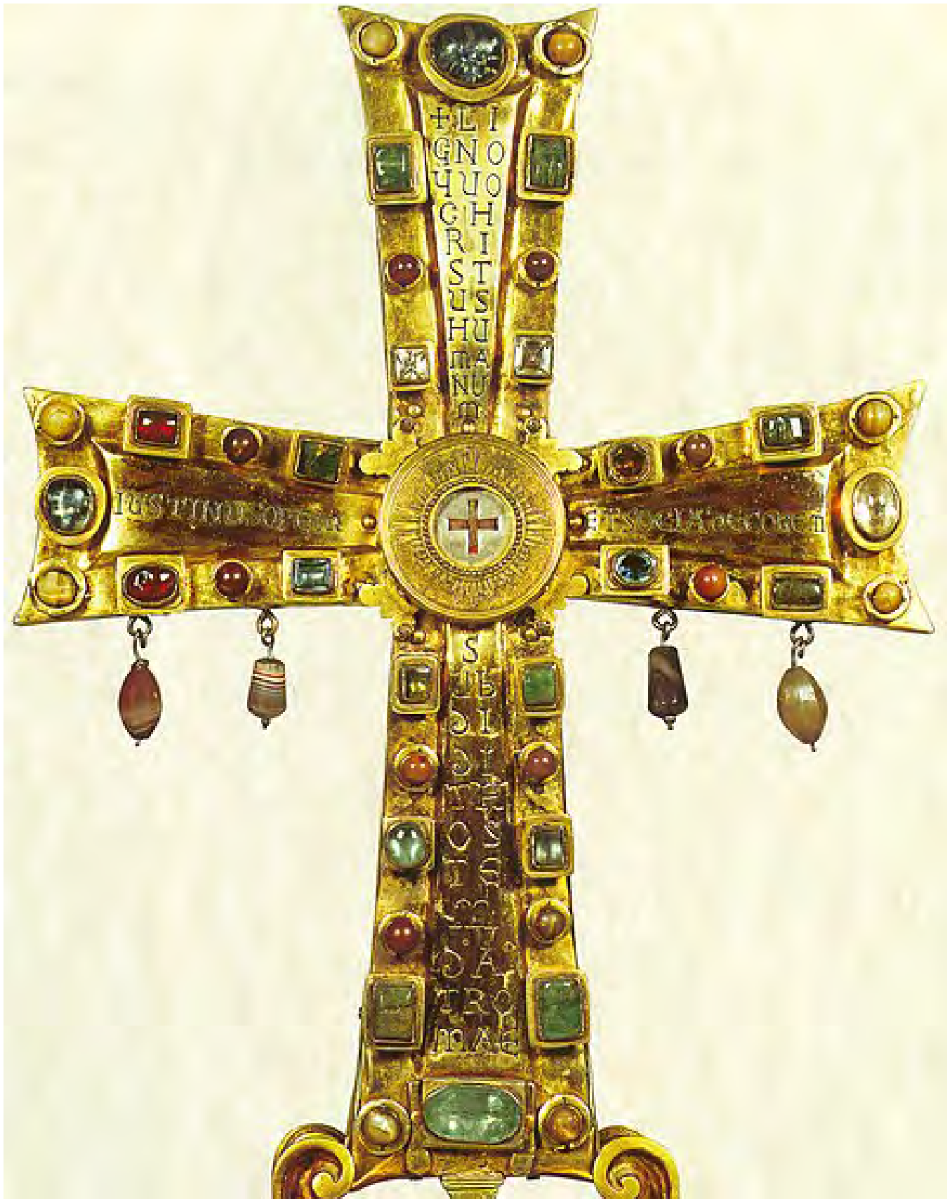
Figure 3. Cruz Vaticana, front, 6th century. Silver-gilt and gems. Treasury of St. Peter's Basilica, Rome.